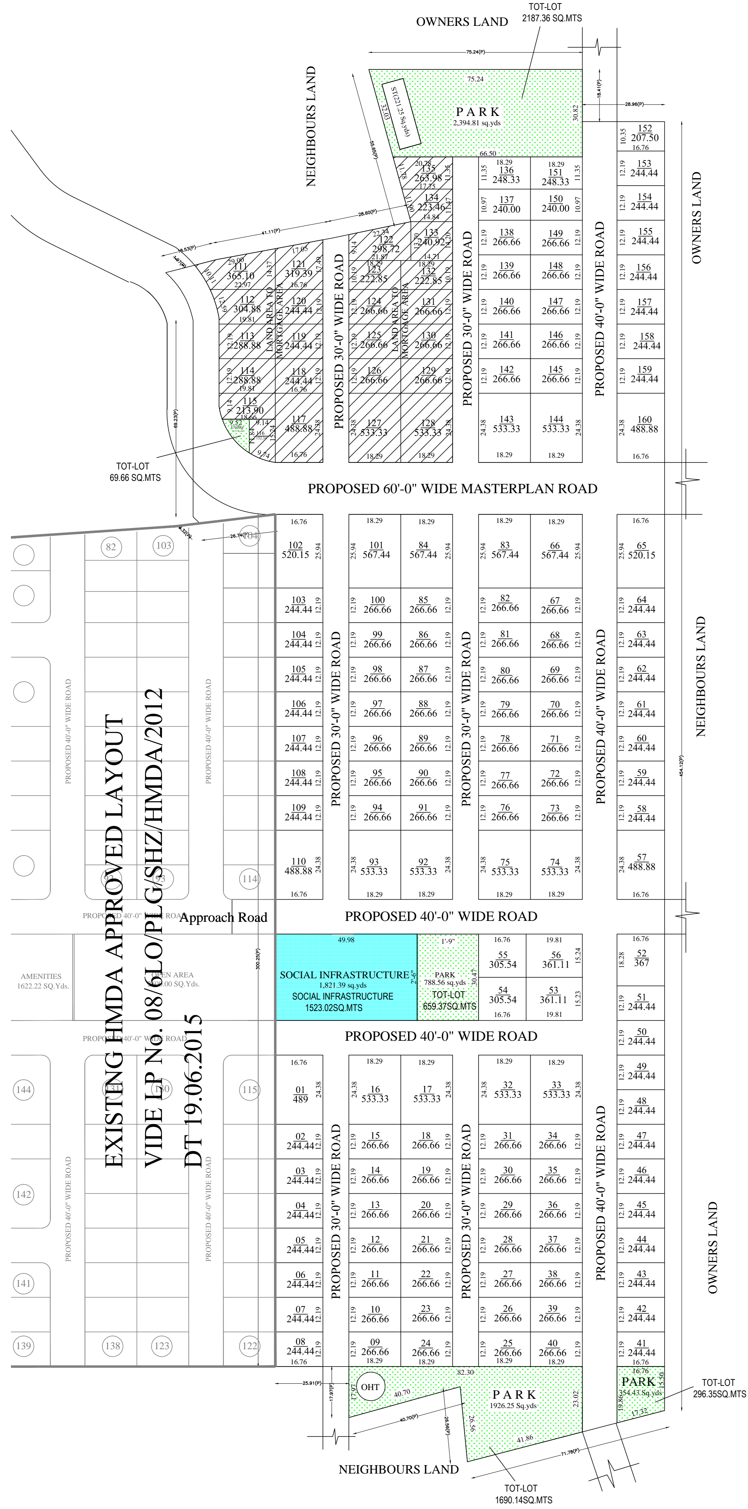
DRAFT LAYOUT SCALE 1:800